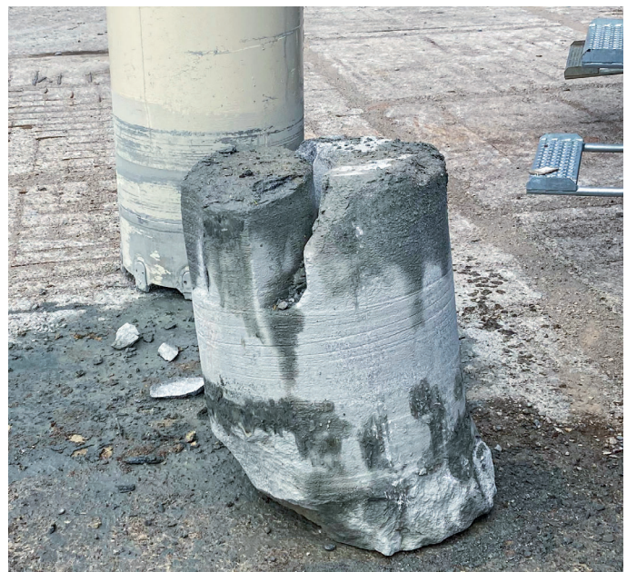
Test 2: Granite core