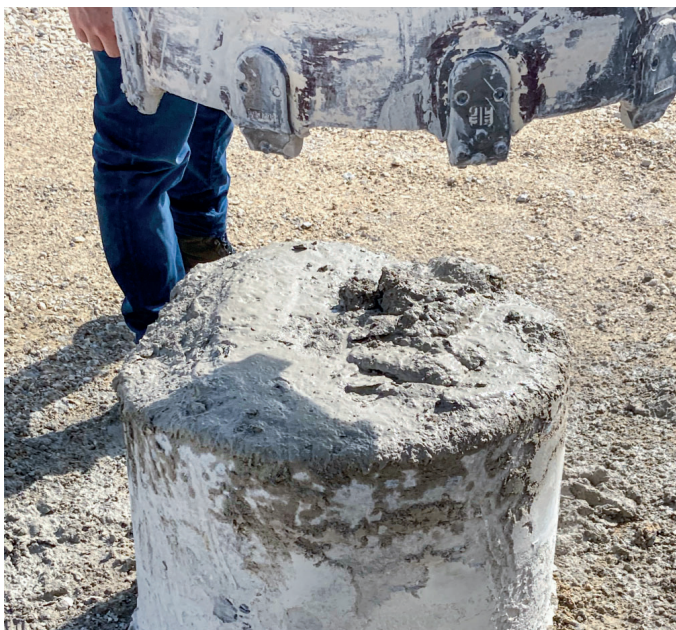
Test 1: Reinforced concrete core

Rock (176 MPa) Drilling progress: 1.4 m/h and approx. 6 m with one set of WS 29-R